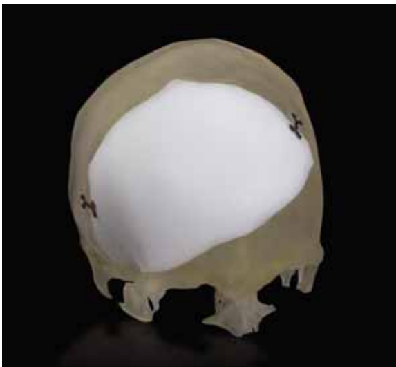
Customized Cranial Implant with MEDPOR Fixation System