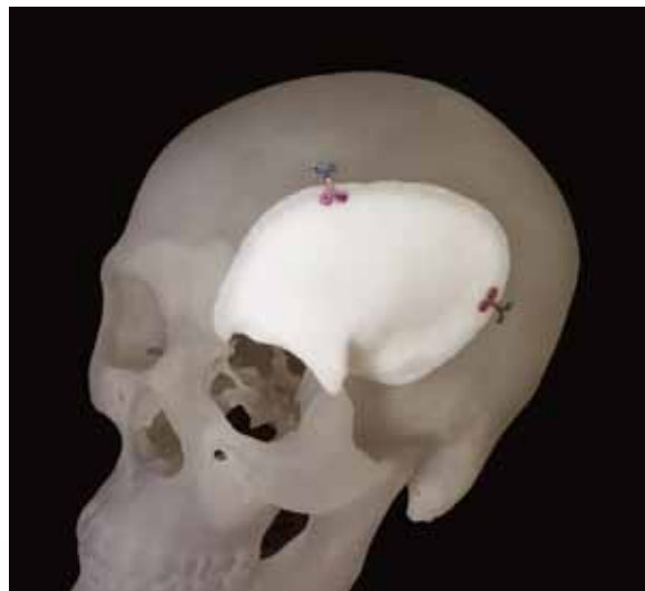
Customized Cranial and Superior Orbit Implant with MEDPOR Fixation System