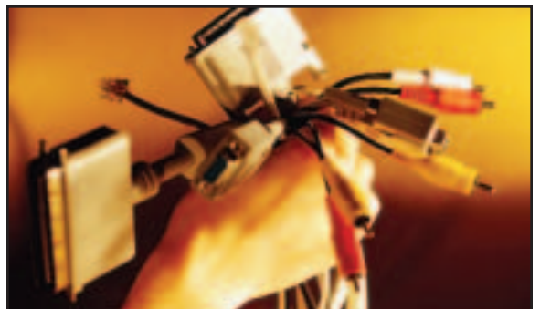
The old way.

Visit your PolyVision dealer to take the PolyVision Challenge. For a listing of local dealerships please visit www.polyvision.com/challenge or contact 1.800.620.POLY